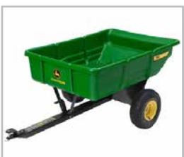
Trailers CPLP21935, CPLPPCT10JD, CPLPPCT17JD