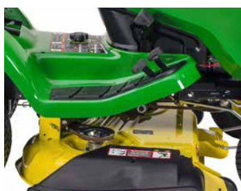
Twin Touch™ Hydrostatic With Cruise Control.