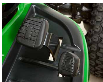
Twin Touch Foot Control