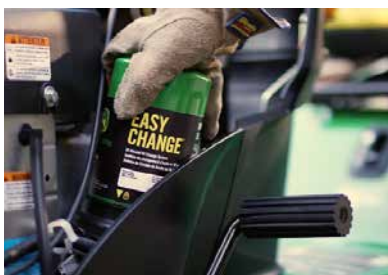
John Deere Easy Change 30 Second Oil Change System *on selected models

Comfortable, affordable and easy to use, the S100 ride-on mowers are built in Greenville, Tennessee. With the John Deere Easy Change™ 30-Second Oil Change System on select models, ergonomic design across the lineup with a wide, and welcoming operator station, these mowers are ground breaking.