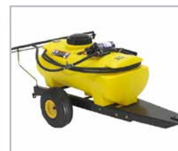
25 Gallon Sprayer CPLP19479