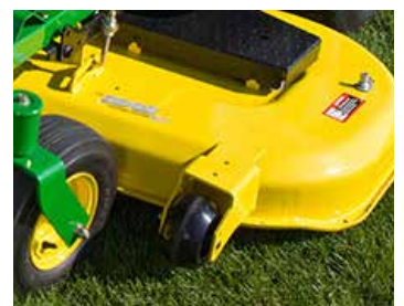
Deliver new levels of cut quality, productivity, cleanliness, durability and versatility.