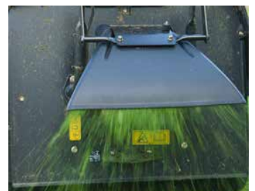
Optional Rear Deector