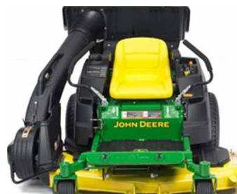
High Capacity Accel Deep™ Mower Deck