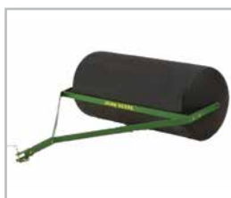
Lawn Roller CPLPPRT36JD