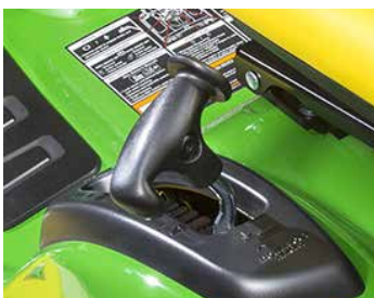
1/4" Adjustable Cutting Height

Mow and collect clippings in comfort and style with the easy to operate rear collection mowers. These dedicated rear discharge mowers feature high capacity baggers that can easily be emptied without leaving the seat and have an audible signal that alerts the operator when the rear bagger is full. A high blade speed and generous chute size allows efficient grass catching capabilities.