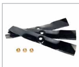
Blade Sets AM141034, AM141036

Select from the John Deere range of optional attachments, service items & accessories to make your mower even more versatile and perform at its best for years to come.