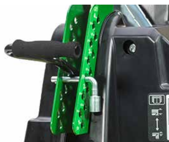
1/4" Adjustable Cutting Height