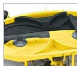
Mulch Kits BM21816, BM20007, BM20827, BG20560, BM25257