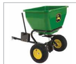
79kg Fertiliser Spreader CPLPBS36JD