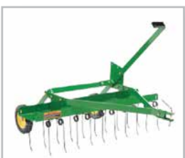
Lawn Thatcherator CPLPTA40JD