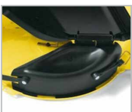
Mulch Cap GY00115