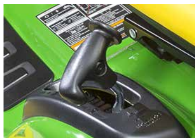
The Redesigned Mower Deck Lifter