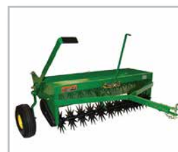
Spike Aerator & Spike Aerator & Spreaders CPLPSAT40JD, CPLPAS40JD, CPLPPA40JD