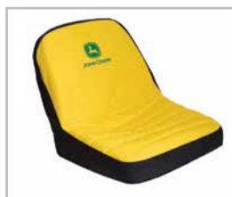
Seat Covers CPLP22074, LP92324, LP92334