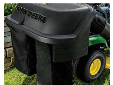
Optional Bagger Kit & Mulch Kits