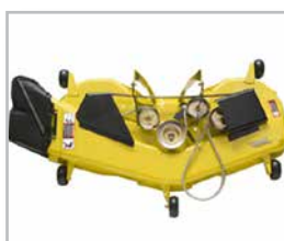
Complete Mower Decks