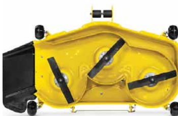
The all-new Accel Deep mower deck is available for Select Series lawn tractors.

Designed for large lawns, these lawn tractors have all the power and comfort you need to get things done. The X300 Series models have impressive features and are easy to operate. With TwinTouch™ foot controls, industry leading ergonomics that make mowing easy and cruise control, mowing your lawn will never be a chore again.