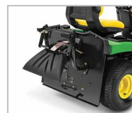
Rear Deflector BG20822, BM25065