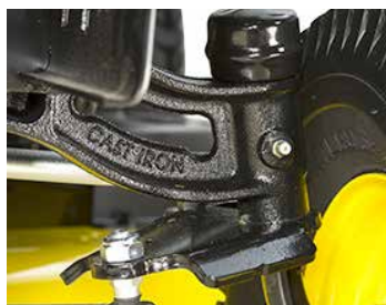
Greasable Cast Iron Front Axle