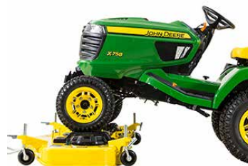
High Capacity Auto Connect Deck