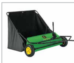
Lawn Sweeper CPLPSTS42JD