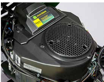
V Twin Kawasaki Engines

X500s mow where you need to go, and do heavy-duty work, too. Their wide stance enhances stability on hillsides and traction can be increased simply by pressing the foot-operated traction control. Heavy-duty frames work with ground-engaging equipment like tillers, and features like the on-board deck-leveling gauge assure a quality cut every time.