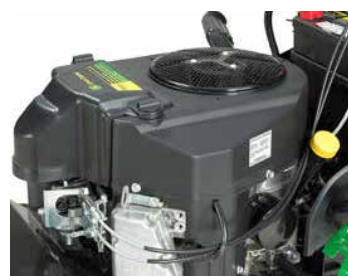
V Twin Kawasaki Engines