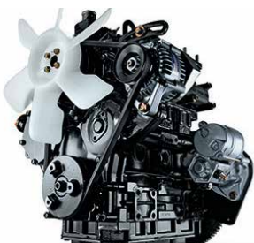
Commercial 3 Cylinder Yanmar Diesel Engine

With multiple models to choose from we are sure that we can match a mower to your large acreage or commercial operations. X700 Signature Series systems offer two drive options - a full time 4 wheel drive system or a 2-wheel drive system. Both feature a special standard Traction Assist foot operated control to get you out, up or over the tough spots.