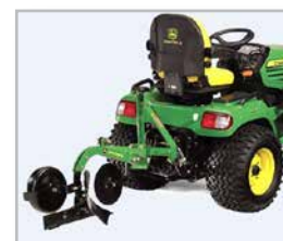
Single Furrow Plough CPLPPP1200JD