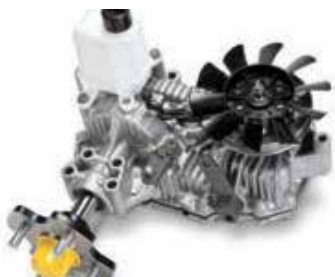
Heavy Duty Transmission

Mow well fast with our new Accel Deep™ Mower Decks, re-engineered to process taller grass at faster speeds. Run at ground speeds of 11.3km/h (7 MPH) - 14.5km/h (9 MPH). Among the fastest in the industry.