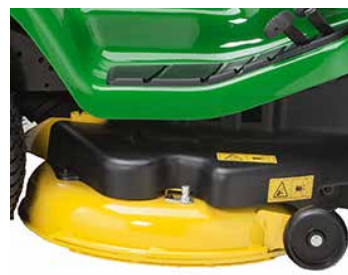
High Capacity Cutting Deck With Washport