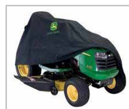
Ride-on Mower Cover LP93917