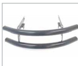
Front Bumper BG204366