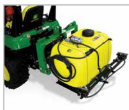
45 Gallon Sprayer CPLP20485