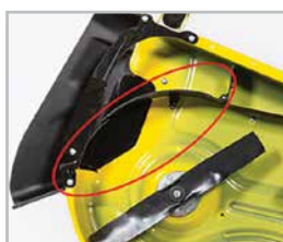
Mulch Control System BM24794, BM24993, BM24994