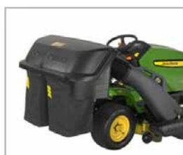
Bagger System BM21871, BM23634, BM21681, BM21873, BM22144, BM21679, BM21680, BM22697, BM21682, BM14653, BM24333, BM20671, BM21682, BM20714, BM24514.