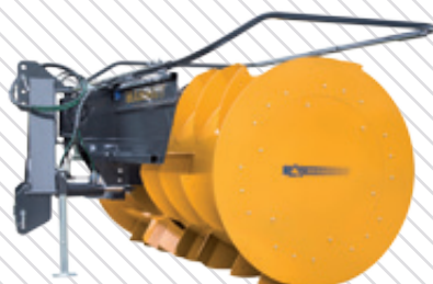
Silo Fox Koloss