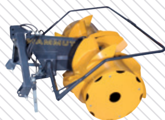
Silo Fox Titan