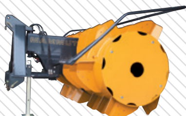
Silo Fox Gigant