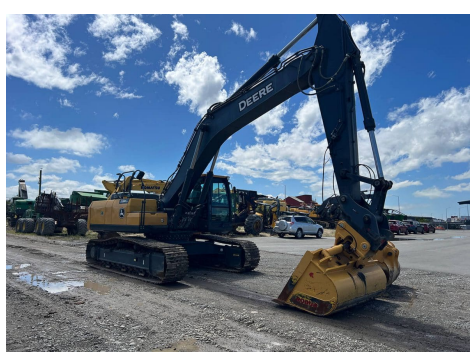
John Deere E300LC-II 250