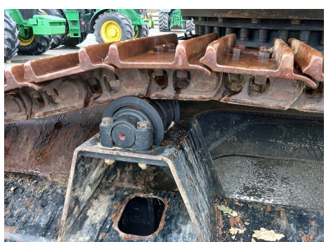
Caterpillar 330D 2L